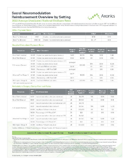
2025 SNM Reimbursement Overview

We offer several resources to provide information related to coding, coverage, and payment for sacral neuromodulation and urethral bulking therapies.