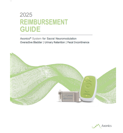
2025 SNM Coding & Reimbursement Guide