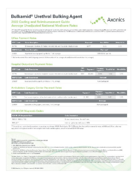
2025 Bulkamid Reimbursement Overview