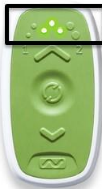
a. device is ready for whole-body MRI