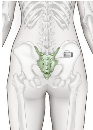
Figure 2-1: Axonics SNM System implant location eligible for MRI scan with Whole-Body RF transmit coil (Neurostimulator 1101 is shown as an example)

Assess neurostimulator implant location prior to an MRI scan using a Whole-Body RF Transmit Coil – Figure 2-1 shows the typical implant location and lead pathway inside a body. The neurostimulator pocket and lead insertion point could be ipsilaterally or contralaterally located. The neurostimulator should be implanted in either the left or right upper buttock area of a patient for MRI scan eligibility using a Whole-Body RF Transmit Coil. MRI Whole-Body scans on a patient with a neurostimulator implanted in locations other than the posterior hip / upper buttock area are untested and may cause unintended stimulation, device damage, or excessive heating, which could result in pain or injury to the tissues surrounding the implants.