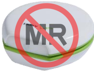
Charger and Dock (Model 1401)