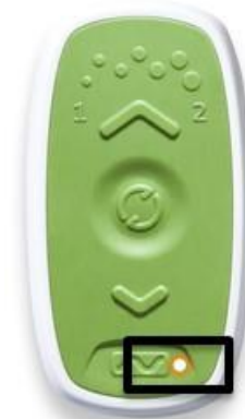
b. see additional MRI eligibility instructions