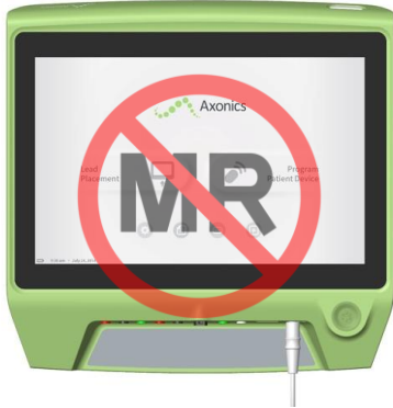
Clinician Programmer (Model 1501/2501)