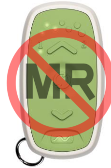
Remote Control (Model 1301/2301)