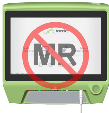
Clinician Programmer (Model 1501/2501)