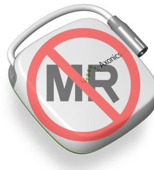
External Pulse Generator (Model 1601), percutaneous leads and cable (Model 1901, 9009, 9014)