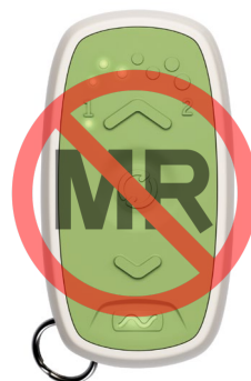
Remote Control (Model 1301/2301)