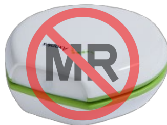
Charger and Dock (Model 1401)